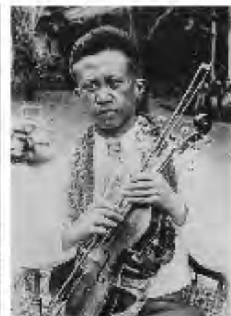
An unidentified musician from Kalaupapa's past, draped in leis, poses with his elegant violin. Ka 'Ohana O Kalaupapa was formed to honor and to perpetuate the memories of all the 8,000 people who were exiled to the peninsula.