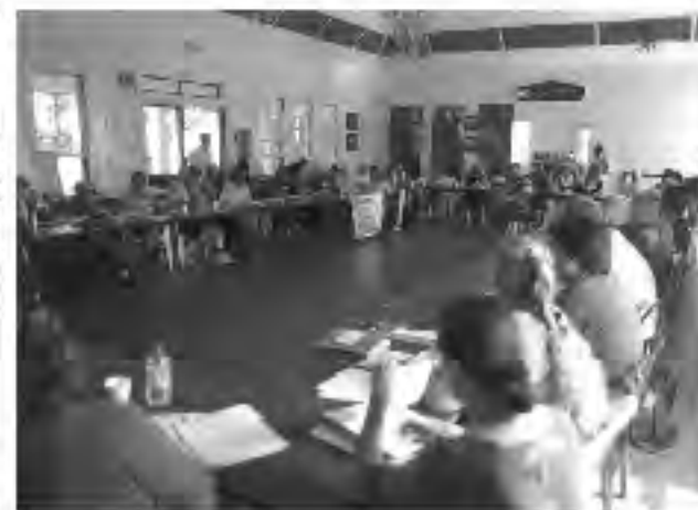
The two-day annual meetings of the 'Ohana have drawn large crowds with lively discussions that have ended with the overall feeling of unity and aloha.