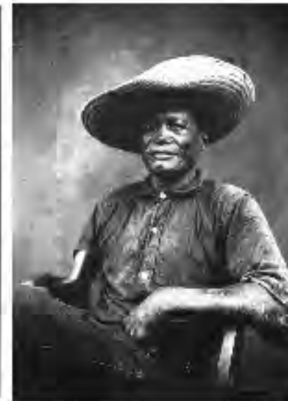
This man wearing a hat may be unknown at this time, but he is part of Ka 'Ohana O Kalaupapa. Maybe someday we will learn who he is - and perhaps find his family.

"I bring my past with me, our lives are the message that we give. All the kids I grew up with in Kalaupapa. In honoring our past, it behooves us to bring honor to them. I honor them. I honor everyone else. Ua pau."